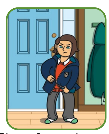
Mum can fix the zip on the jacket.