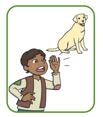
The man can yell to the dog.